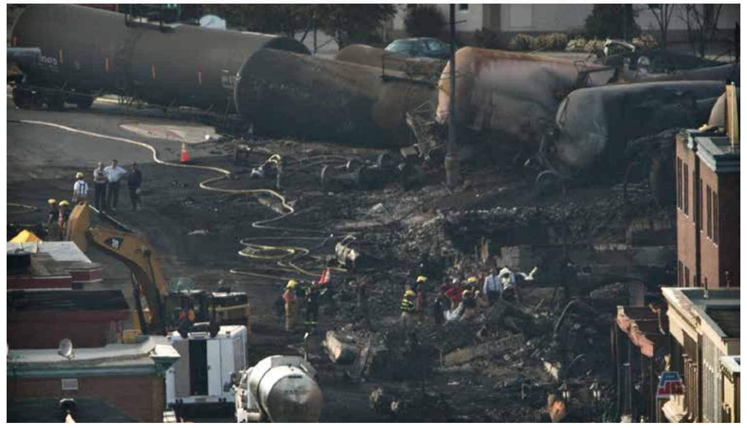
LAC-MEGANTIC QC - JULY 8: Search teams carry a large white bag out of the rubble in the town centre of Lac-MÈgantic during their search for the dead Monday evening. 47 people died from the tragedy after a train derailment caused a massive explosion early Saturday morning.