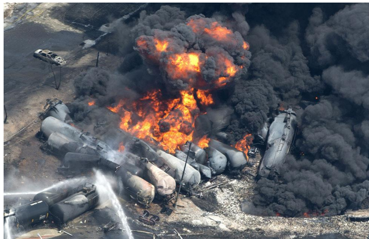
Lac-Mégantic, Quebec 14

Incidents involving crude oil from the Bakken shale formation have been particularly devastating – most notably, the tragic accident in July 2013 in Lac-Mégantic, Quebec, where 63 tank cars of crude oil exploded, killing 47 people. 13