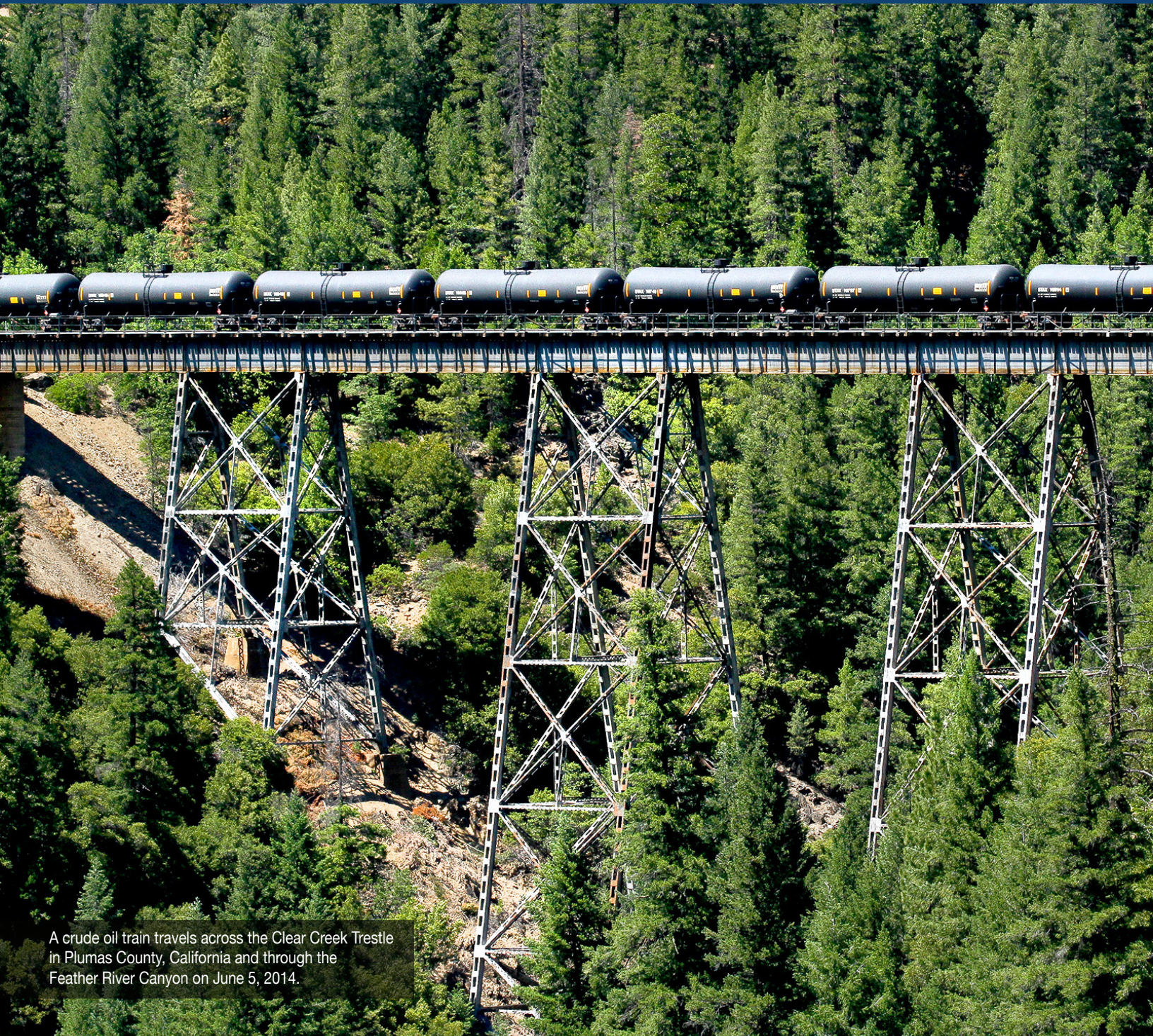
A crude oil train travels across the Clear Creek Trestle in Plumas County, California and through the Feather River Canyon on June 5, 2014.